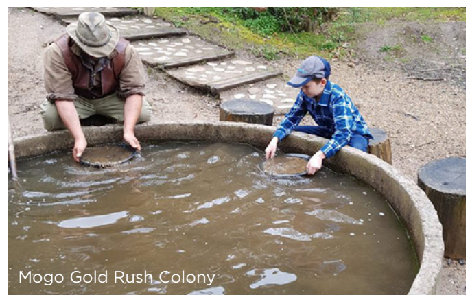
Mogo Gold Rush Colony