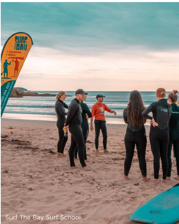
Surf The Bay Surf School

All Barlings Beach Guests receive special loyalty discounts at these awesome local attractions.